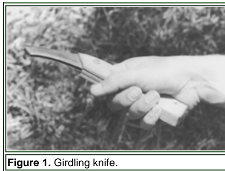
Figure 1. Girdling knife.

Girdling is achieved with a specially designed girdling knife (Figure 1). Scoring, a related cultural practice, involves cutting, severing of bark and underlying vascular tissue (to the wood) with a knife, but scoring does not remove bark tissue. Large-bladed knives of several types are satisfactory for scoring.