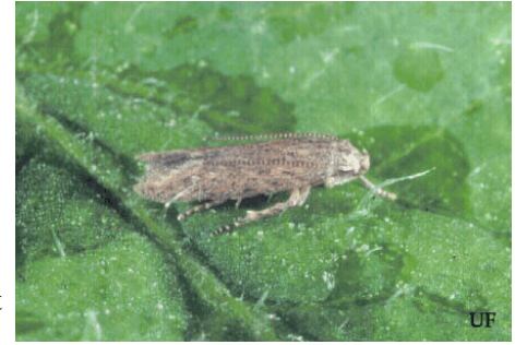
Tomato pinworm adult.

Immature stages: Eggs are deposited in small clusters (3-7) on leaves, but are seldom seen because of their small size. Young larvae are yellowish-gray with a brown head capsule. As the larva matures it develops dorsal coloration that initially is orangish or brownish and eventually turns purplish. The mature larva measures 5.8-7.9 mm. All larvae appear smooth skinned without any prominent hairs.